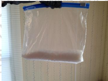
Gallon Zip Lock Baggie of "ICE" Methamphetamine

The arrests were the result of search warrants executed on April 5, 2013 at a residence on Fairlane Circle in Warrenton and another on Highway M outside Wright City. The warrants culminated from an ongoing investigation into the possession, use, and distribution of the crystal form of methamphetamine known as "ICE". Investigators seized approximately two ounces of methamphetamine, scales, baggies, syringes, and drug paraphernalia.